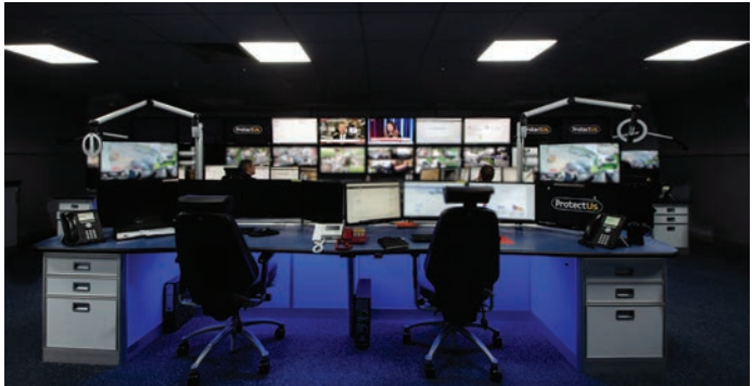
Top: The new consoles provide plenty of space for the working area, with ample space between each console, giving a light, airy feel to the new control room.

Above: The underscript LED lighting provides a glow without distractions on the screens above.